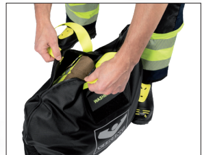
Specially designed zipper