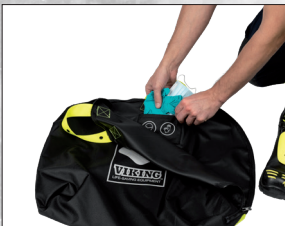
Perfect for storage

You can then register and follow the washing process with your VIKING Track & Trace system.