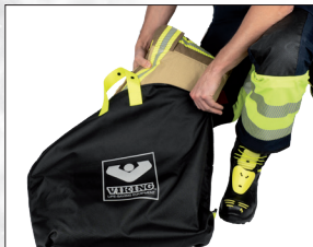
Enough room for everything